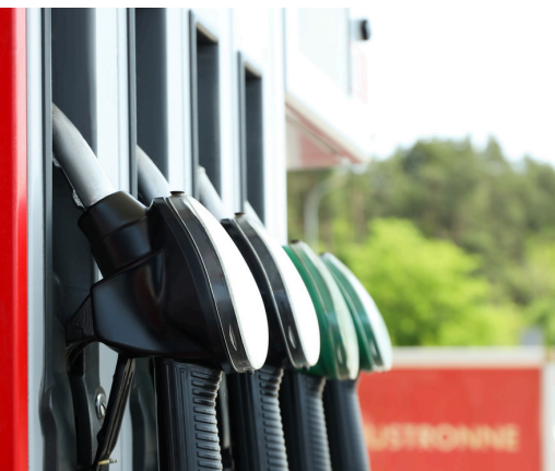
FUEL LEVY NOTICES