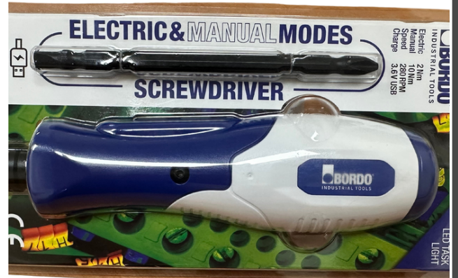
BORDO ELECTRICAL AND MANUAL SCREWDRIVER