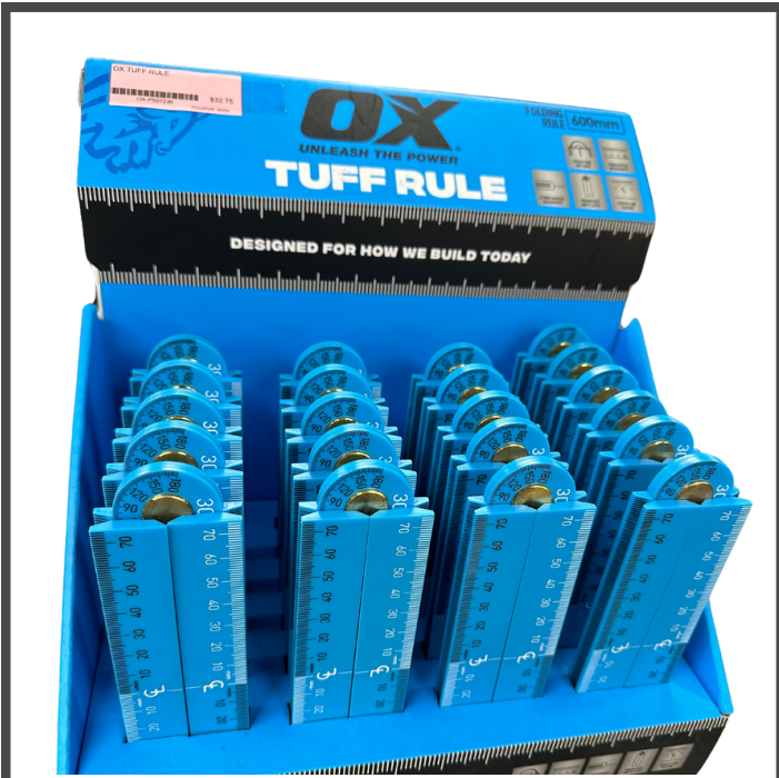
OX TUFF RULE