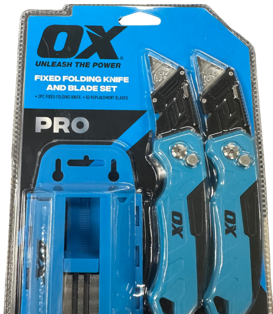
OX FIX FOLDING KNIFE & BLADE SET