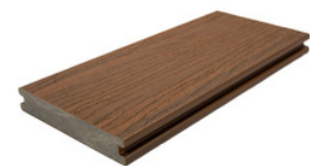
US49H 138mm board