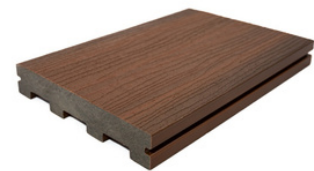
US71H 210mm board