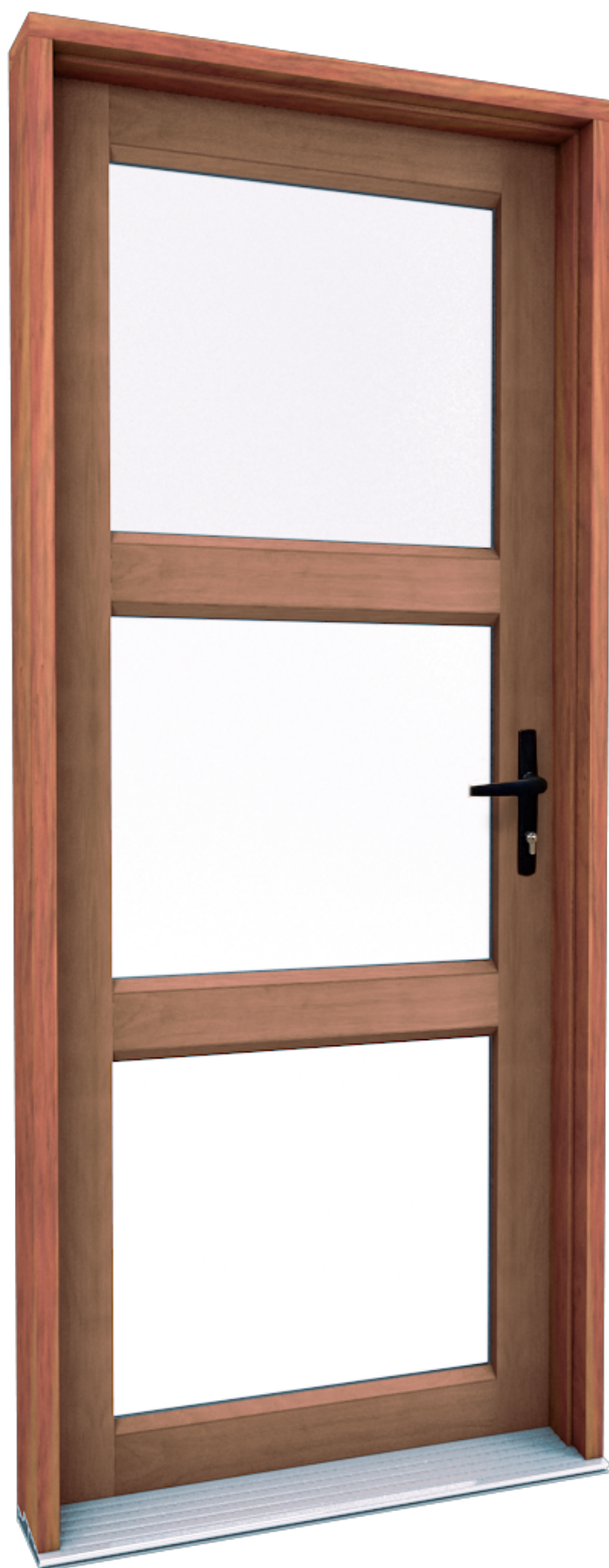
XE3 in Weatherguard Timber Frame